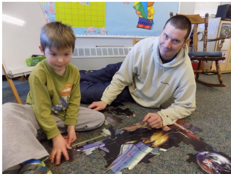
Dad's and Donut Day Redeemer Pre-school

Thank you for the support for the Easter breakfast.