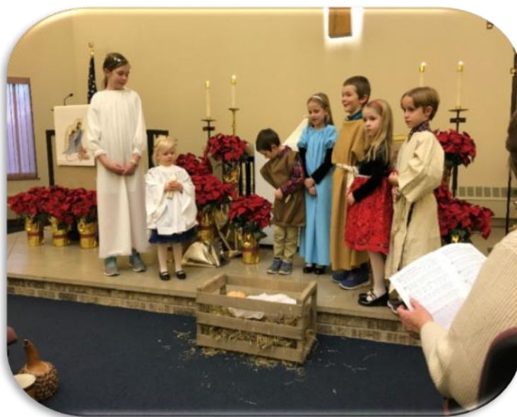
The Sunday School Children presented the Christmas story in song during a blessed Christmas.