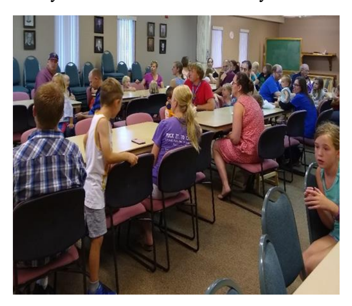
The kids sang the songs they learned.

The annual church picnic with the VBS potluck evening had a good turnout and some great food. The Camp Omega guides lead us in a singing table prayer. They also highlighted the daily Bible verses and VBS daily schedule